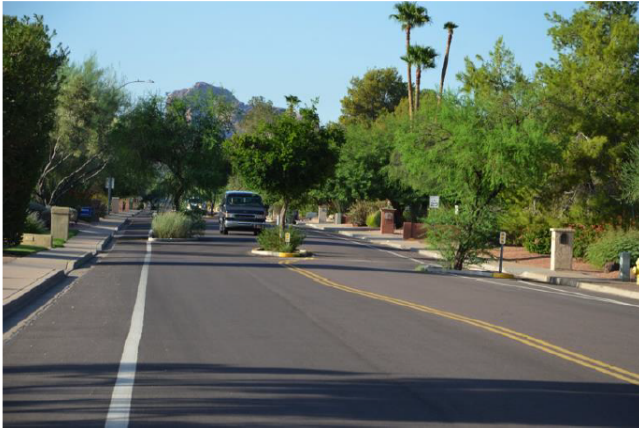
Figure 12.3 – Chicane (Two-way travel)