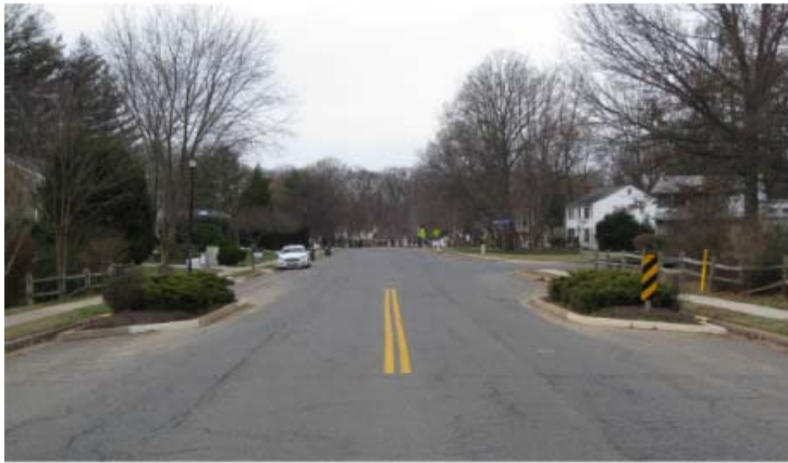
Figure 13.1 – 2-Lane, 2-Way Choker