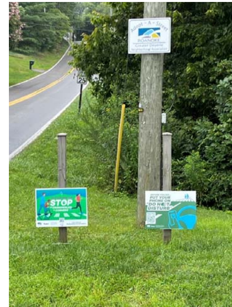
Deyerle Road / Brandon Ave