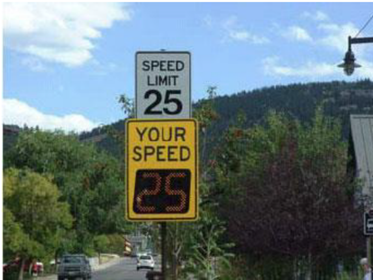
Figure 3.1 –Pole Mounted Speed Display Sign