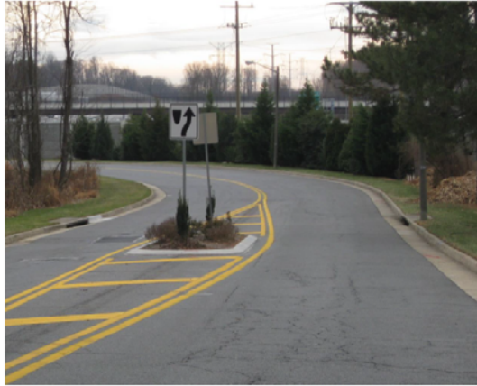
Figure 10.1 - Median Island